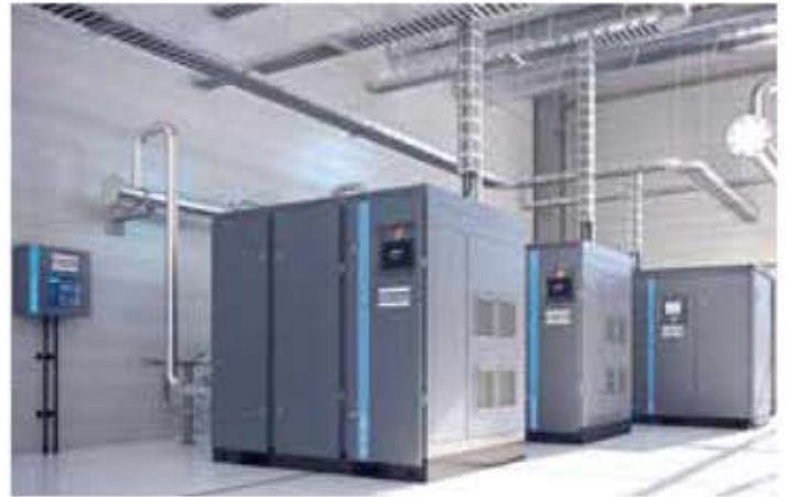
Oil-Free ZR 90-160 VSD+