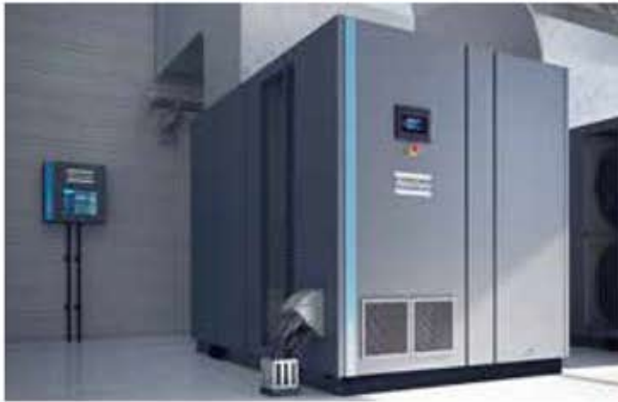
Oil-Injected GA 110-160 VSD+

The new GA110-160 VSD+ and the ZR90-160 VSD+ are the biggest innovation within compressed air (for these size machines) in the last decade. They offer triple efficiency benefits, covering energy, service and uptime. We're so confident in what they can do, we have launched an unprecedented introductory offer.